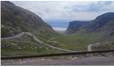
Balach na ba Pass