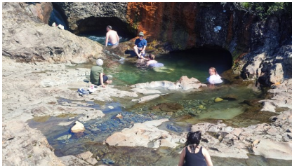
Fairy Pools Isle of Skye