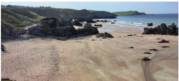
Sanga Sands Beach