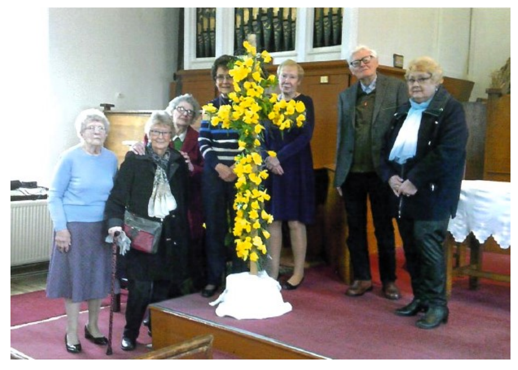
Members and friend at Holymoorside URC with their Easter Cross.